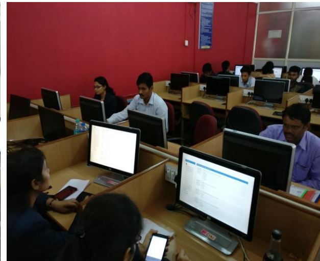
During online exam hour candidates registering their register numbers